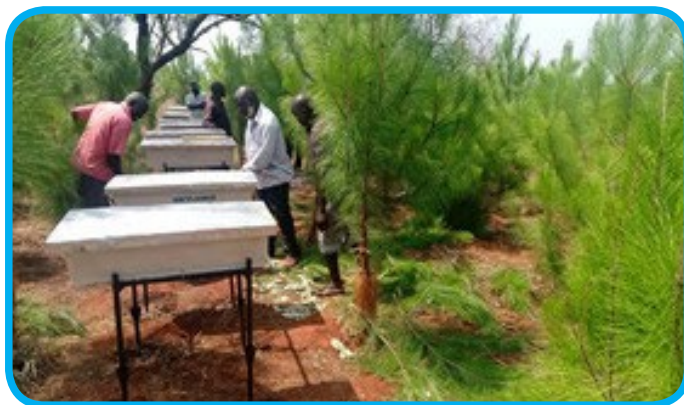
Fig 3: Apiary promoted as an Eco-enterprise, Farmers in Abim district setting up their beehives

Key Implementing partners: CARE Uganda, Wetlands International Eastern Africa, Facilitation for Peace and Development (FAPAD), Facilitation for Innovative Actions and Sustainable development (FINASP) CARITAS Lira and CARITAS Kotido, National Forestry Authority (NFA), Ngetta Zonal Agricultural Research Institute (ZARDI).