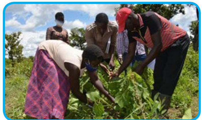
Fig 4: Farmer Managed Natural Regeneration of indigenous tree species implemented by farmers in Otuke Districts