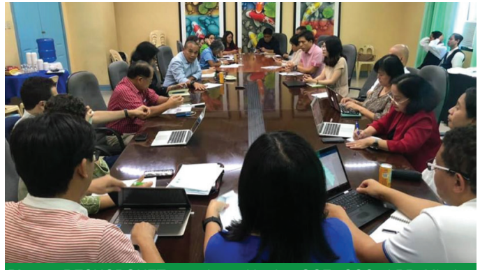
Photo: RESUGBONET meeting with the GCF, CCC, LBP Mission delegation to discuss climate change mitigation and adaptation project ideas and strategies.