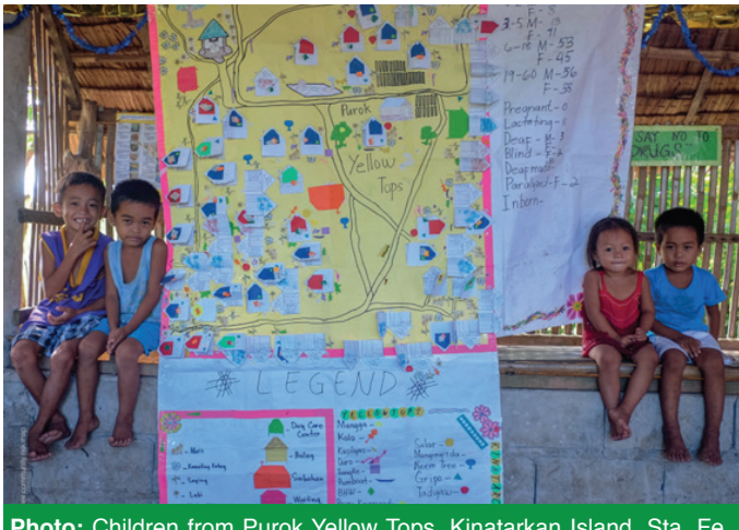
Photo: Children from Purok Yellow Tops, Kinatarkan Island, Sta. Fe, Cebu beside their community risk map using IRM approach.