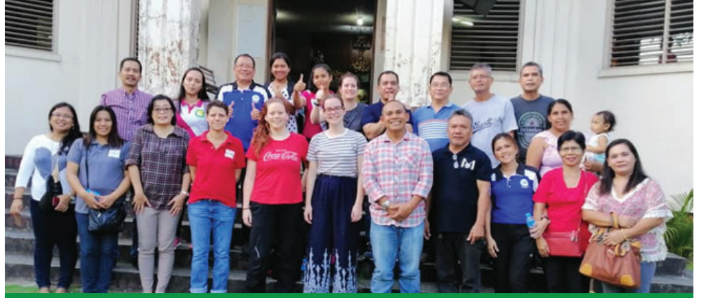
Photo: In February 2019, a learning visit was organized in Jagobiao and was participated by PfR Philippines (The Netherlands Red Cross & the Philippines Red Cross), Cordaid Netherlands, RESUGBONET and partners.