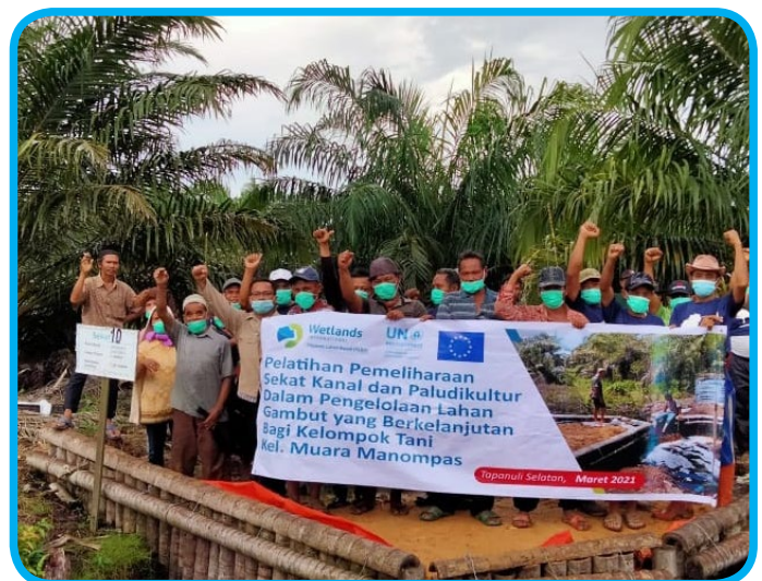
Fig 4: Community groups conducted peer trainings on canal blocking maintenance