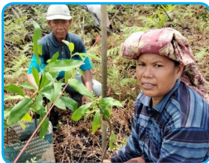
Fig 3: Community group members planting Jelutong, the peat native species in rewetted peat area

Key partners: Wetlands International Indonesia, Village and sub district authorities, police and military forces, district level authorities (Development planning Agency), Disaster Management Agency, Agricultural and Fishery Agency), Provincial Development Planning Agency, National Development Planning Agency, Ministry of Environment and Forestry, National Disaster Management Agency, and Peat and Mangrove Restoration Agency.